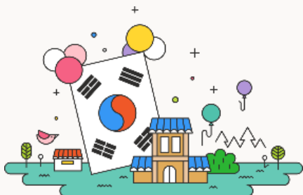
Diverse K-Culture Activities